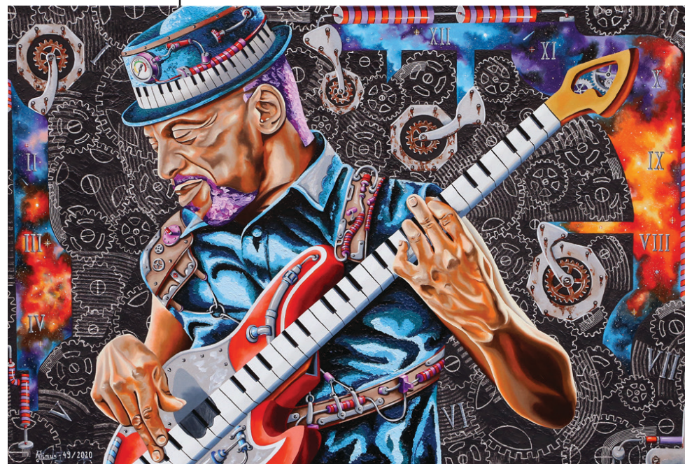
Dark sounds / 95 cm x 135 cm

michael.marschollek@icloud.com www.KrzysztofZyngiel.com +48 601 317 930